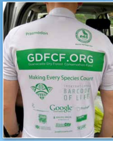
Team Prasmodon jersey features Area Conservación Guanacaste, GDFCF and iBOL logos.

Team Prasmodon also submitted their entry to the 508's "Green Team" program that supports environmental efforts. In addition to iBOL, other Prasmodon sponsors include Google Labs: Fusion Tables; Ontario Genomics Institute; Profisee.com; StationFilms.com; JosephRossano.com; SDJA.com; ecomagic.org; Kyoto Prize Symposium; Stanford Medical Center Alumni Association; Sharp Triathlon Team; Vermarc USA; and RiverCity Screenprinting Inc.